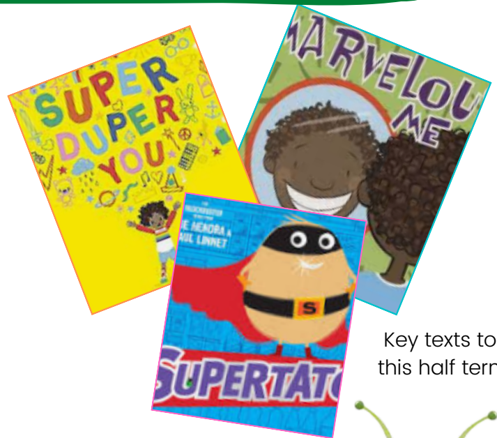
Key texts to this half term

The Reception Team are eager to begin this learning with your children and are pleased to have started this journey with you and the children.