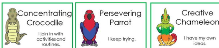
Our learning zoo.

The first set of sounds we will explore are: s a t i p n