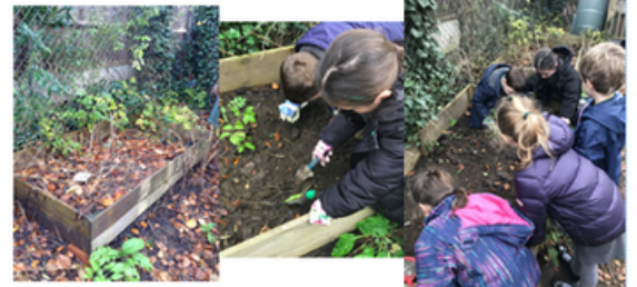
We're gardening to prepare an area to plant seeds in the spring. This will encourage wildlife to visit our school grounds, we will be supporting Bio-diversity and helping our classmates learn about this too.

Parents can now bring old batteries to the school office to put in our special recycling box . Full boxes are collected and batteries recycled instead of going in the bin. We are going to find out the total weight of batteries we recycle this year!